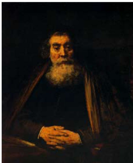
Portrait of Comenius by Rembrandt

prestigious awards honouring achievements in the fields of education research and innovation, commemorates Comenius. Each Czech should be proud of Comenius and his favour all over the world.