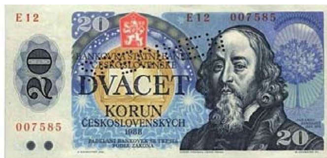
Comenius on a Czechoslovak 20 koruna banknote (the banknote is over its validity now)

The European school partnership programme for schools as named after John Amos Comenius. Lots of schools are involved in the Comenius project work. Our students and teachers have got some experiences with a Comenius project work. Our school is involved in Comenius project from 2000. Our partners